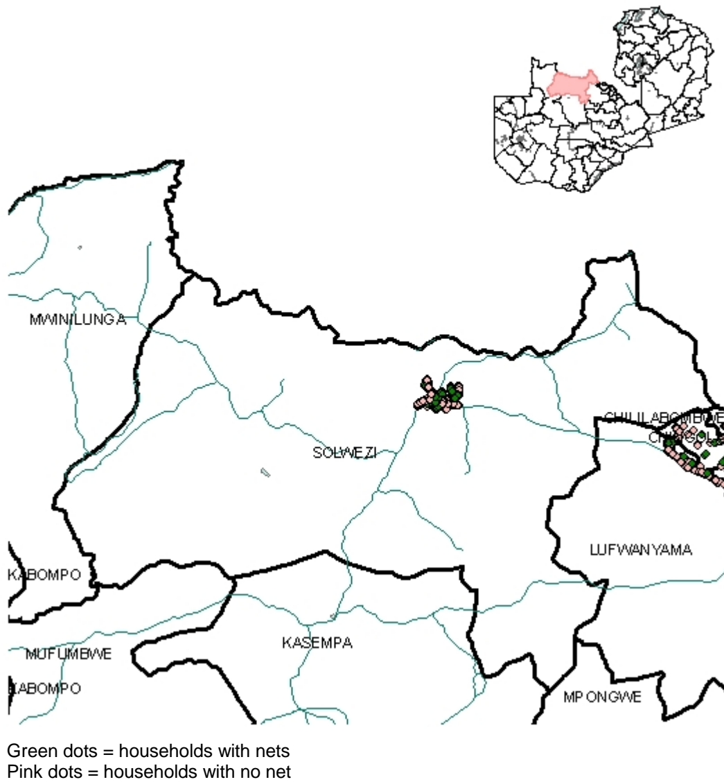
Figure 1: Household enumeration activities by mosquito net availability