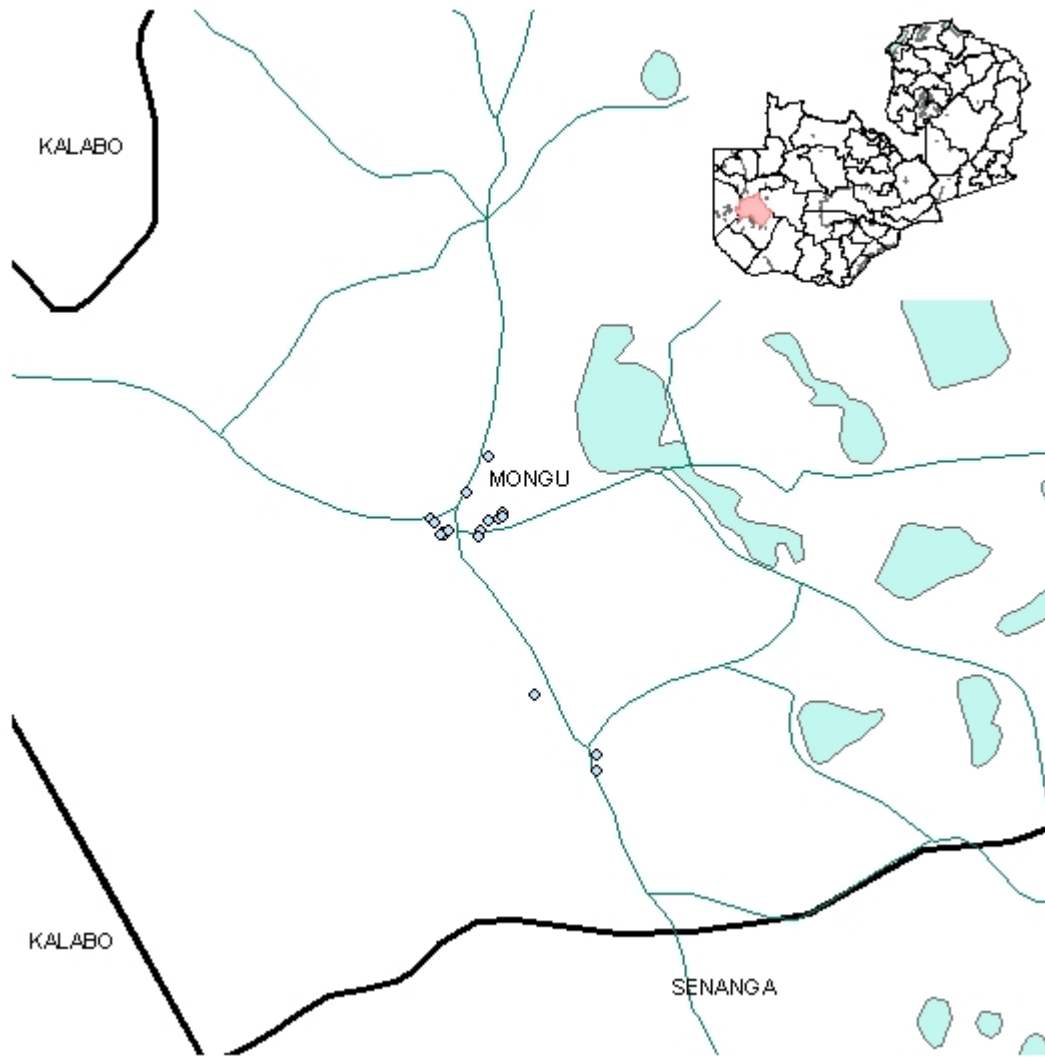
Figure 3: Households enumeration reported sprayed in the previous 12 months

Blue dots = houses reported sprayed within the previous 12 months