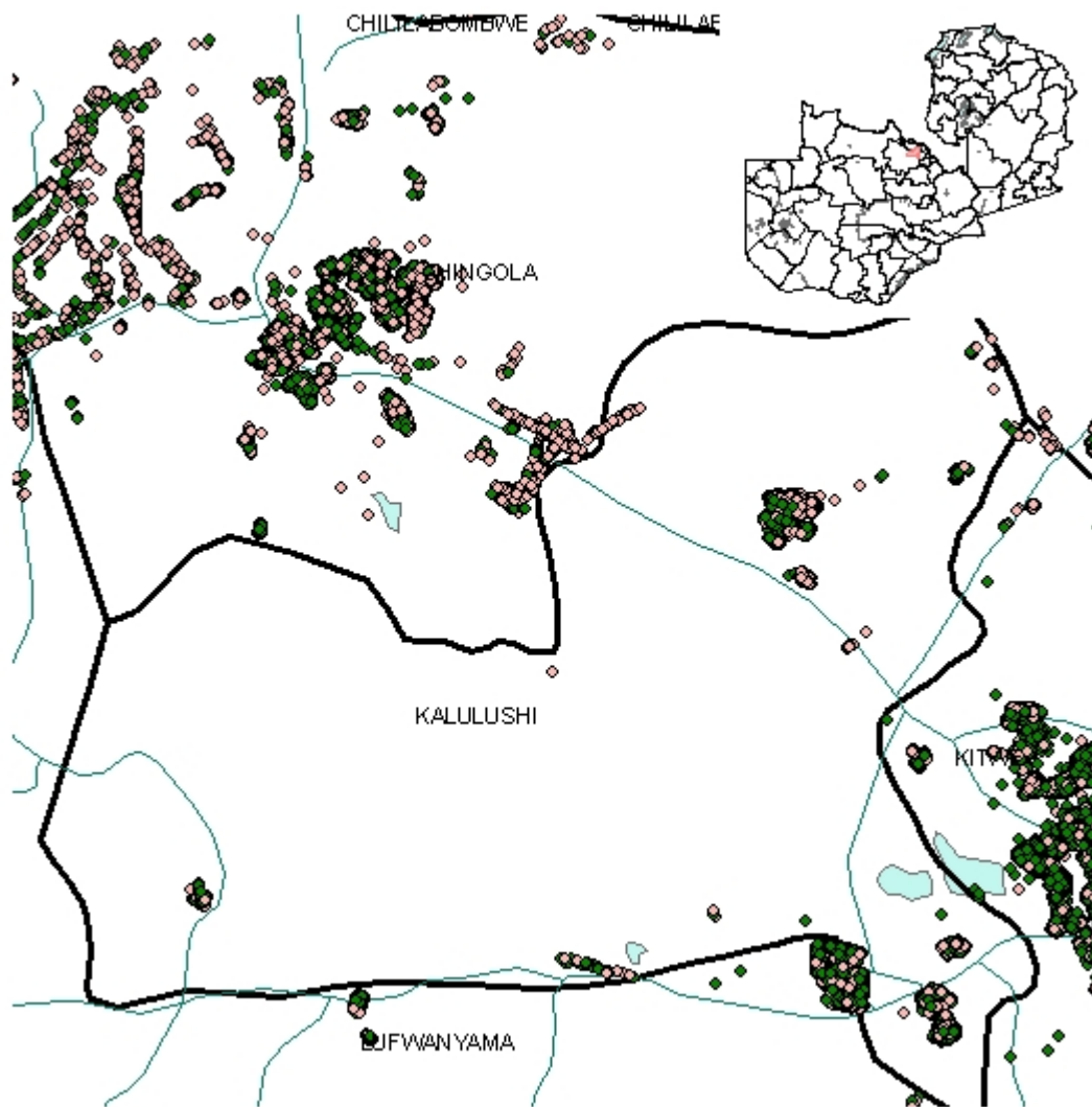
Figure 1: Household enumeration activities by mosquito net availability

Green dots = households with nets Pink dots = households with no net