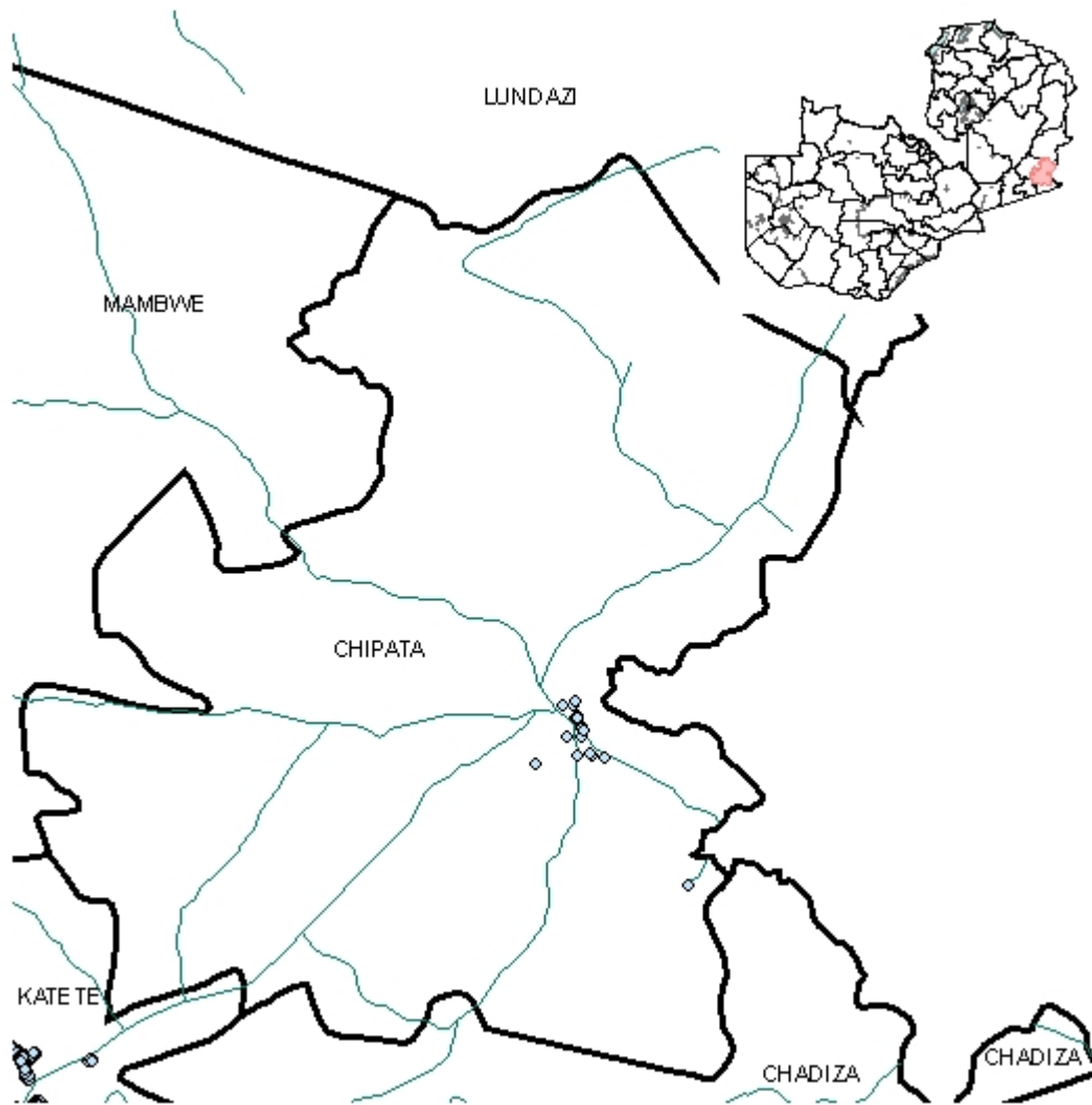
Figure 3: Households enumeration reported sprayed in the previous 12 months

Blue dots = houses reported sprayed within the previous 12 months